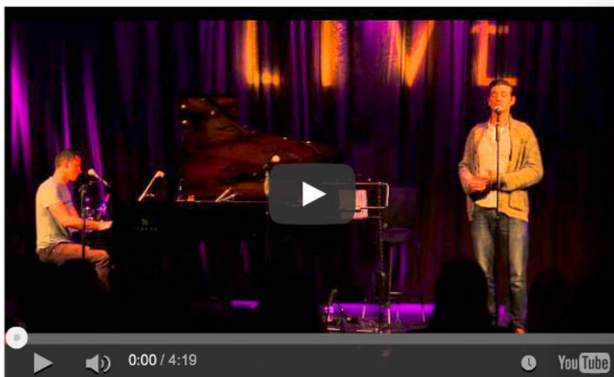
OLIVER TOMPSETT SINGS "LETTING GO OF YOU" @THE LONDON HIPPODROME